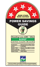
15 Ltr 25 Ltr 35Ltr 50Ltr 80/100Ltr