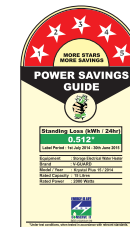
6 Ltr 10 Ltr 15 Ltr 25 Ltr