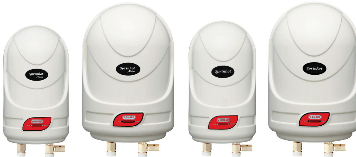
1 Ltr Metro